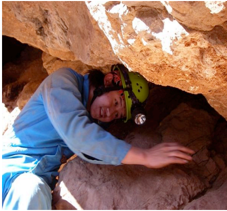
Me getting out of F188