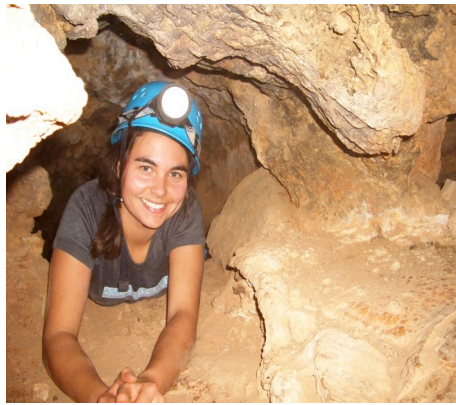
Bronya in F188