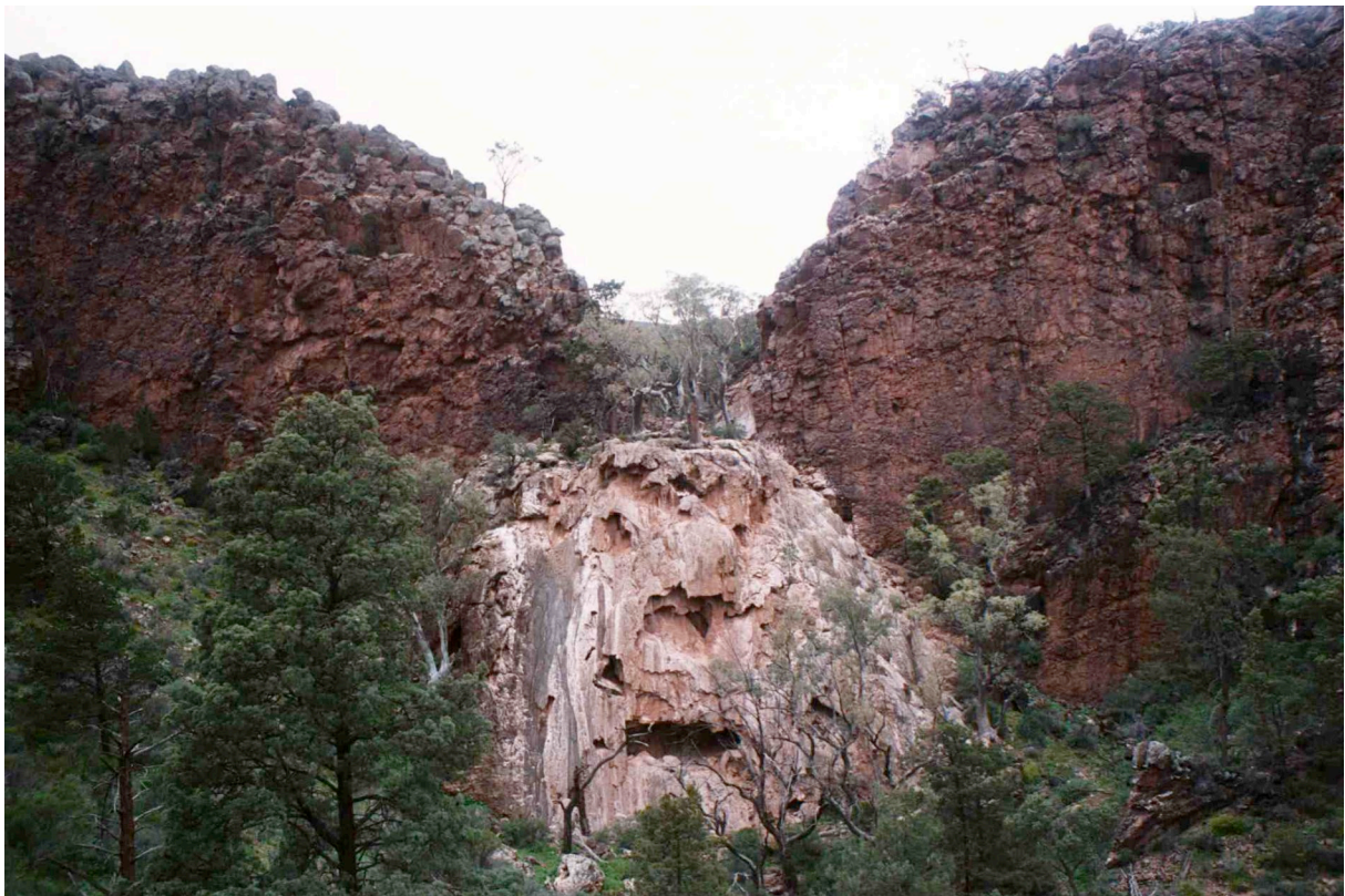
Skull Rock from the viewing area

Skull Rock is sometimes referred to simply as “The Skull” or as “Skull Cave”. The owner of the property, and direction signs use the name “Skull Rock”. The turn-off to Skull Rock is about 500m north-east past the Blinman turn-off on the Wilpena-Wirrealpa road, just by a green shed (and old miner’s dugout if you look closely). It is not signposted. The road is reasonably rough, heading east over flat to undulating country into the foothills of the Bunkers, crossing several gullies where recent heavy rain had partially eroded the road. It meanders into the Bunkers and reaches a car park bulldozed by the owner near the head of a valley. The last 200m of the 10.3km distance is covered on foot.