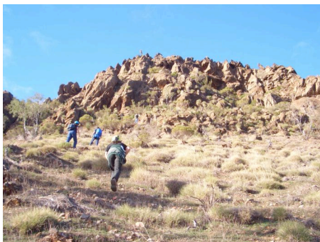
We're getting there

The next day was spent walking, walking and walking. We walked through the gorge and checked out some caves found by FUSSI members in 2000: Sisyphean Slip F188, the Purple Zinc Cave F189 and Paul's Rift F190. F189 is almost completely blocked by creek debris and it will require some serious digging to get into it!