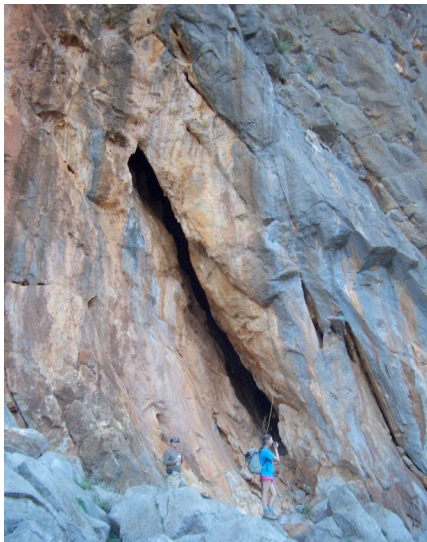
Paul's Rift F190

The final day was spent packing and cleaning before we all headed home. Home sweet home it was!