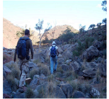
On the way through the gorge.